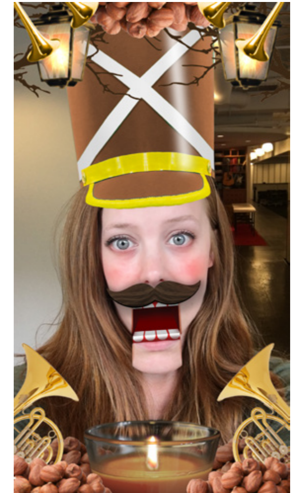
Remaining collection choices.

User selects a theme from a selection screen divided in 4, for each scent in the collection. They are animated with a hat, mustache, and nutcracker-style mouth.